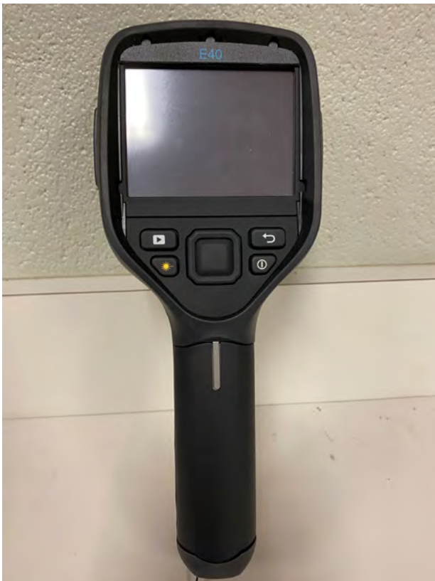
FIGURE 6. EXAMPLE OF HANDHELD THERMAL IMAGING CAMERA - FRONT