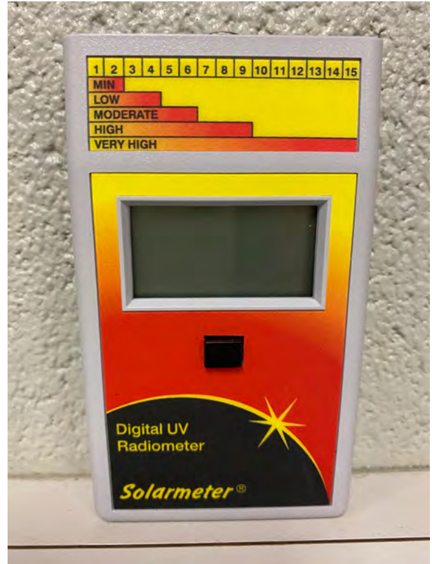
FIGURE 5. EXAMPLE OF DIGITAL UV RADIOMETER