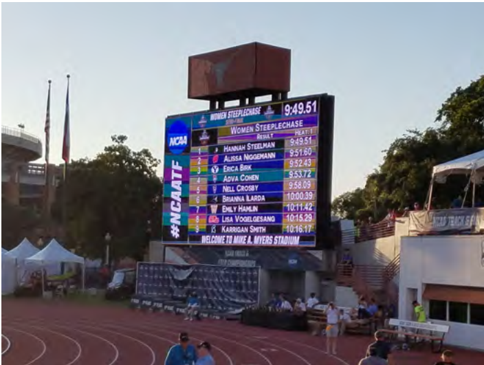
FIGURE 1. 2019 NCAA DIVISION I OUTDOOR TRACK AND FIELD CHAMPIONSHIP