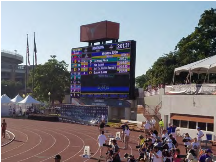
FIGURE 2. 2019 NCAA DIVISION I OUTDOOR TRACK AND FIELD CHAMPIONSHIP