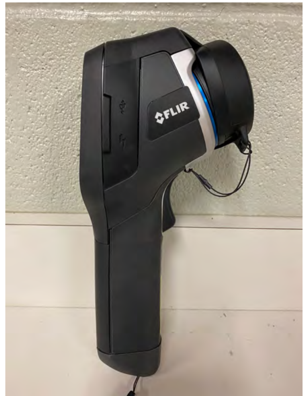
FIGURE 7. EXAMPLE OF HANDHELD THERMAL IMAGING CAMERA - SIDE