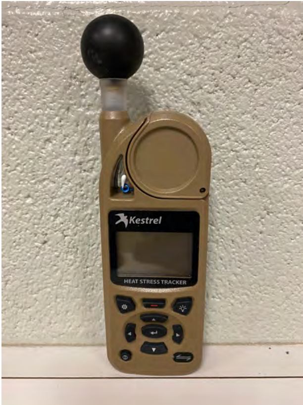
FIGURE 4. EXAMPLE OF A HEAT STRESS MONITOR