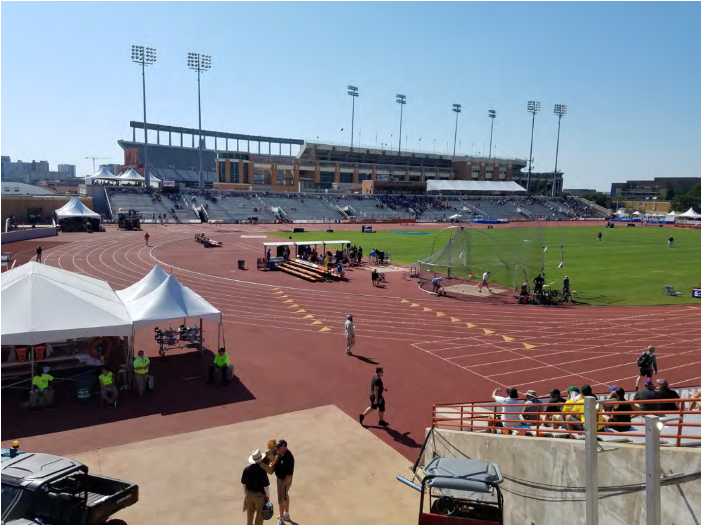
FIGURE 3. 2019 NCAA DIVISION I OUTDOOR TRACK AND FIELD CHAMPIONSHIP