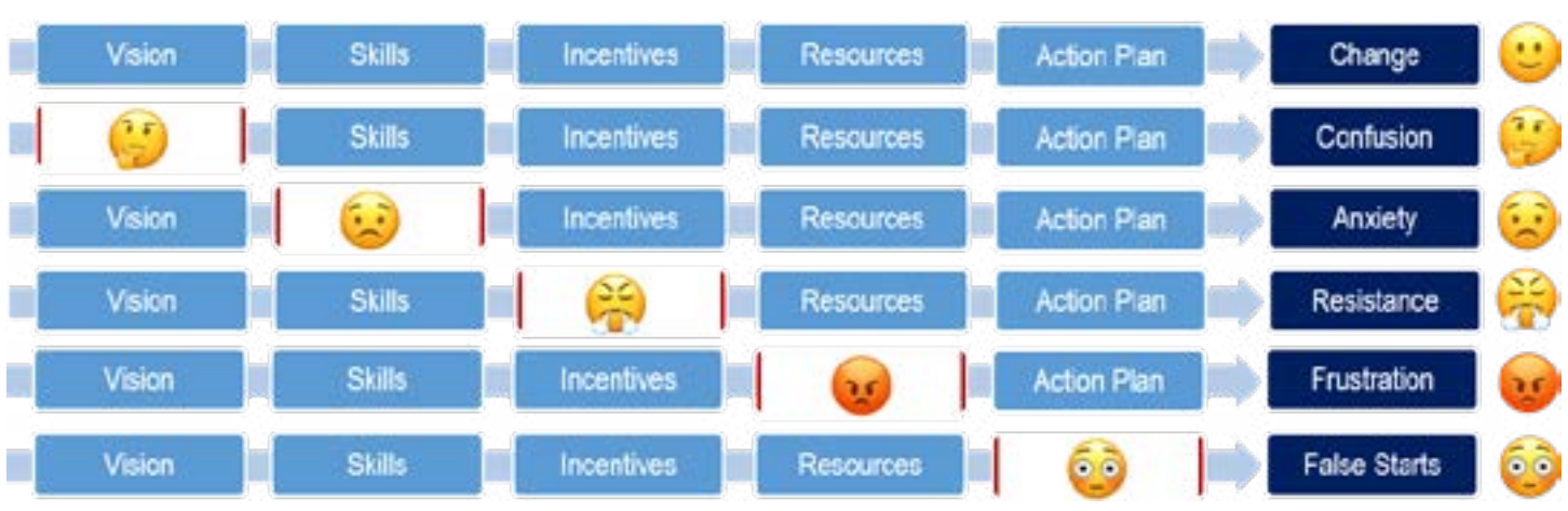
FIGURE 1. THEMES FOR EFFECTIVE CHANGE

Communication is a reoccurring central theme, which is considered as one of the most vital tools for any business, and is a highly valued and regarded discipline in the theory and practice of sport leadership (14). Communication is considered to be the most imperative characteristic displayed in successful organizational leadership, and is a key factor when managing complex change (10,17). In order to successfully manage complex change, a framework for change can be useful (13). Knoster, Villa and Thousand present key themes when thinking about systems for managing complex change, which includes vision, skills, incentives, resources, and an action plan (13). Effective change is a result of all themes being addressed (Figure 1). Conversely, inability to address all themes (i.e., missing pieces in the sequences) can result in negative behavioral consequences, including: confusion, anxiety, resistance, frustration, and false starts. Hence, the take home message emphasizes the importance of the organizational vision being openly communicated and understood by the highperformance staff. This can only be achieved when there is clear purpose and meaning.