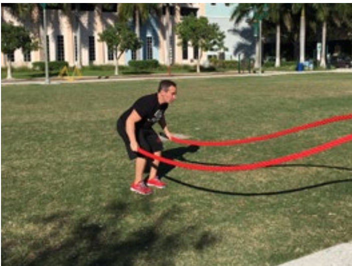
FIGURE 3. ROPE SPIRAL