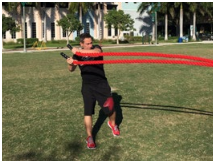
FIGURE 10. ROPE RAINBOW