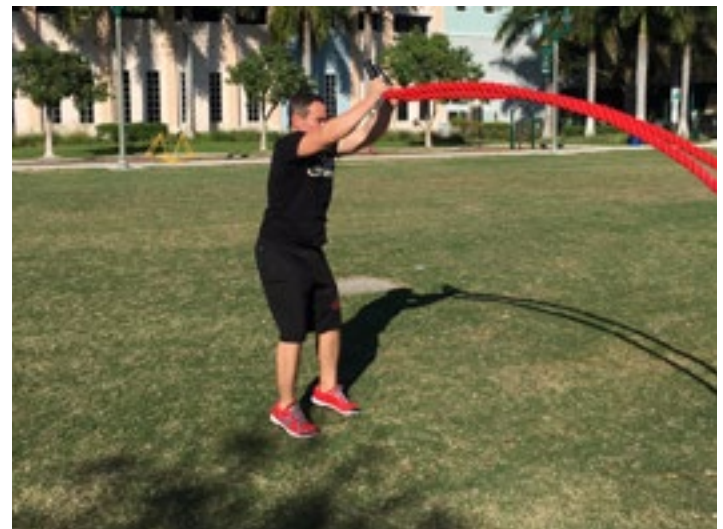
FIGURE 8. ROPE PRESS WAVE