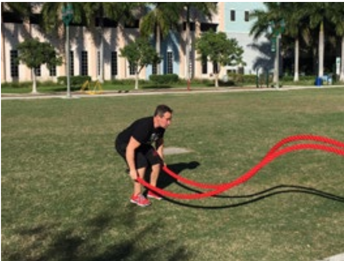
FIGURE 1. ROPE TIDAL WAVE

Keeping your elbows slightly bent, make outward circular motions with both hands, moving your arms from your knees to above your head to create a spiral pattern. Repeat this motion as fast as possible without pausing at any point until the set is completed. Do not just use your arms; allow your entire body to contribute to the motion of rapidly moving the ropes.