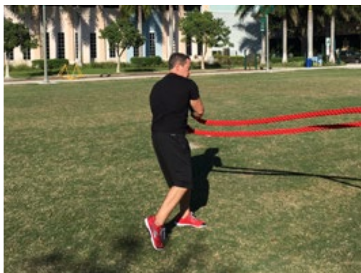
FIGURE 11. ROPE RAINBOW