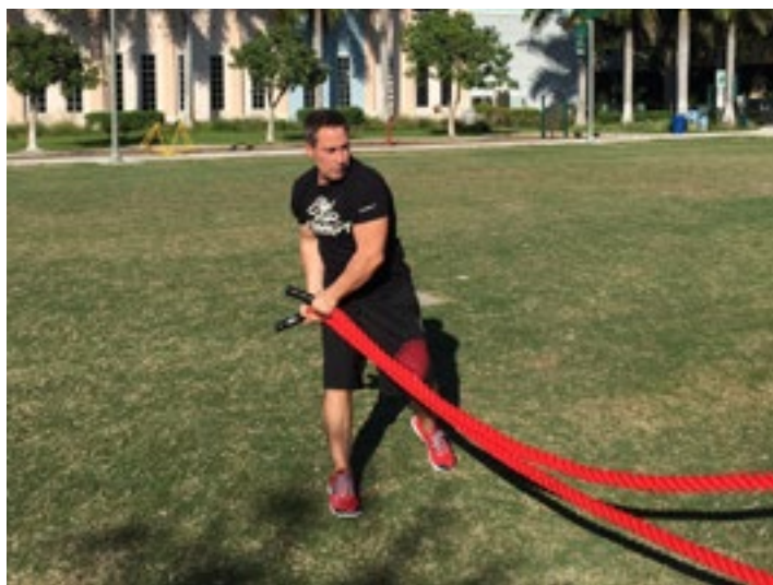
FIGURE 9. ROPE RAINBOW

Move the ropes back and forth in a manner that is fast but smooth and coordinated; do not use a jerking, stop-and-start motion. Use your legs by allowing your knees to bend as your arms lower to each side and by extending your legs each time your arms are overhead when you go back to center.