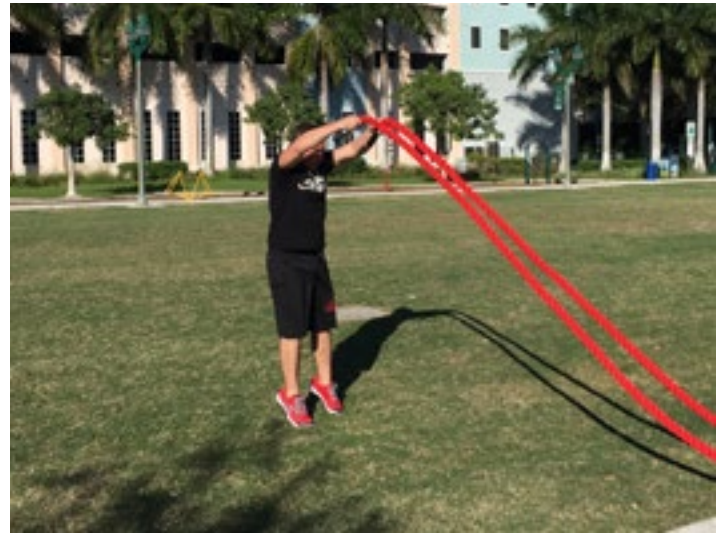
FIGURE 2. ROPE TIDAL WAVE