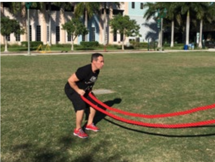
FIGURE 7. ROPE PRESS WAVE

set is completed. Do not just use your arms; allow your entire body to contribute to the motion of rapidly moving the ropes. Since this exercise uses the opposite grip than rope tidal waves, the emphasis of this exercise is reversed. It emphasizes a pushing action—driving the rope away from you—instead of a pulling action—driving the rope down into the ground—to create the waves.