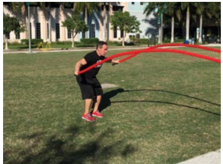
FIGURE 4. ROPE SPIRAL