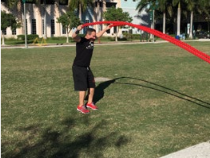
FIGURE 5. ROPE SPIRAL