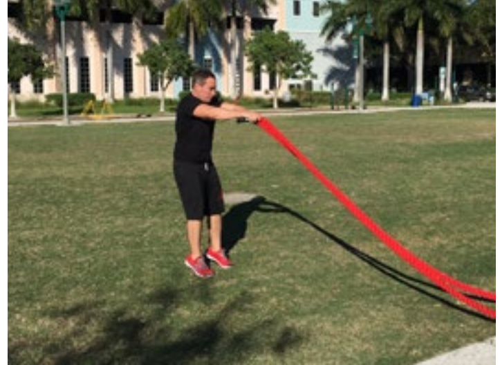
FIGURE 6. ROPE SPIRAL