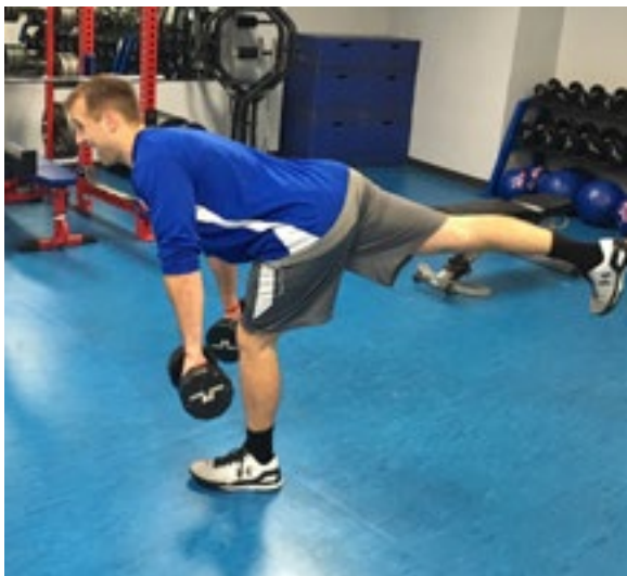
FIGURE 20. DUMBBELL SINGLE-LEG ROMANIAN DEADLIFT