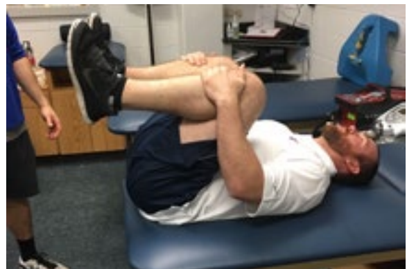
FIGURE 3. THOMAS TEST

The Thomas test is used to test tightness in the hip flexors and differentiate hip flexor tightness between the iliopsoas and rectus femoris. Many basketball players have tight hip flexors and this test helps to identify if tightness exists in both muscles or if it is localized to one muscle, as well as helps determine disparities between the limbs (7). This test begins with the athlete on a training table or bench with both legs tucked up towards the chest. The athlete releases one leg at a time letting the hip fully extend while holding the opposite leg in place near the chest. Downward pressure can also be added to the extended leg to help determine tightness and flexibility.