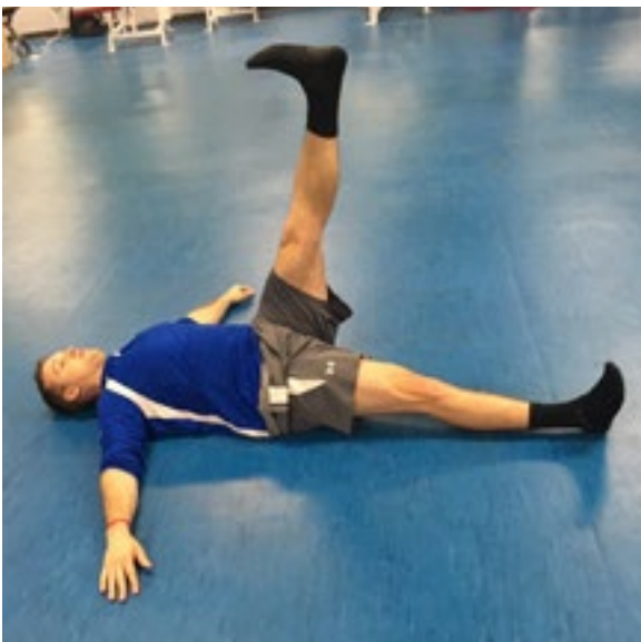
FIGURE 10. ACTIVE STRAIGHT-LEG RAISE TEST