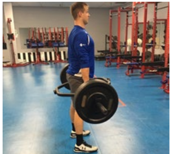
FIGURE 22. TRAP BAR DEADLIFT