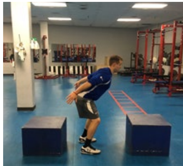
FIGURE 28. DEPTH JUMP TO BOX