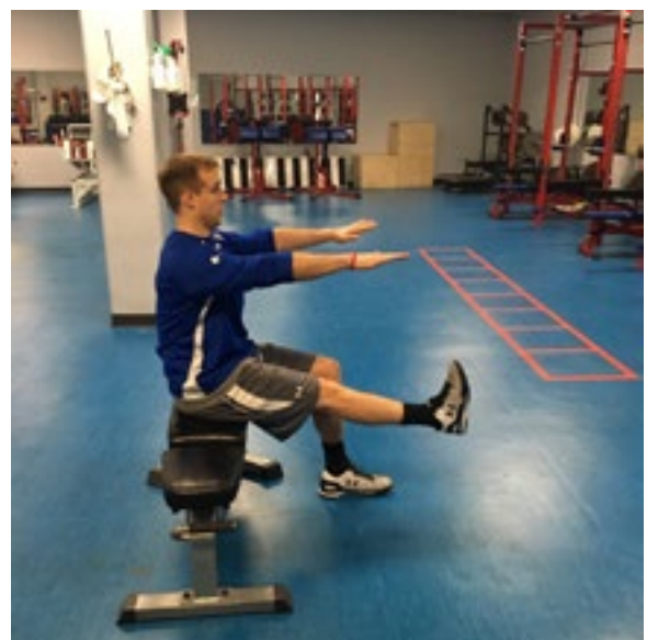
FIGURE 18. PISTOL SQUAT ON BENCH