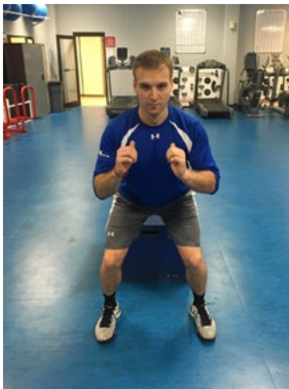
FIGURE 8. DROP LANDING TEST