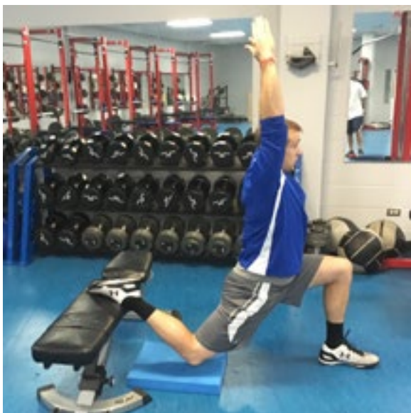
FIGURE 12. BULGARIAN HIP FLEXOR STRETCH