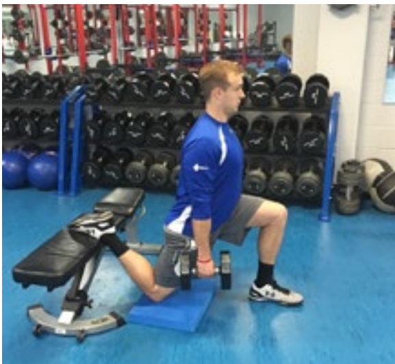
FIGURE 24. DUMBBELL BULGARIAN SPLIT SQUAT