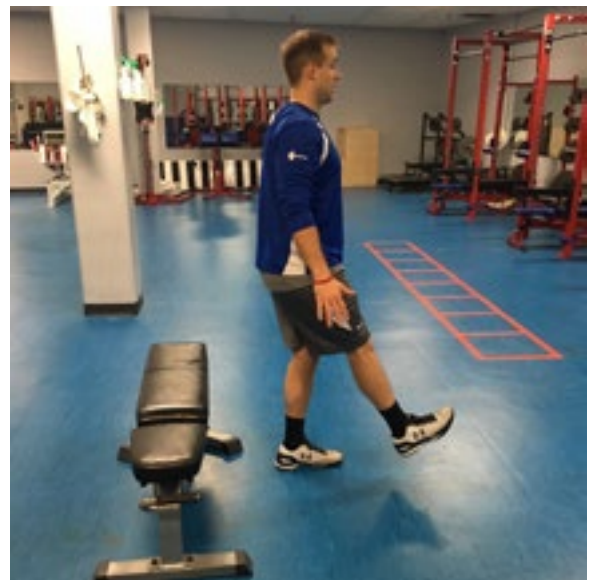
FIGURE 17. PISTOL SQUAT ON BENCH

The exercise begins with the athlete standing on one leg. Slowly and under control, the athlete sits back while maintaining the alignment with the knee and toes until they reach the bench. The athlete pauses for a second on the bench and then stands back up using the same leg, returning to the starting position. This exercise helps teach the athlete to track the knee over the toes without letting the knee move anteriorly over the toes. It works the quadriceps and gluteals of the working leg. This exercise can be used in all phases of the off-season and in-season as a warm-up/activation or in the exercise routine itself.