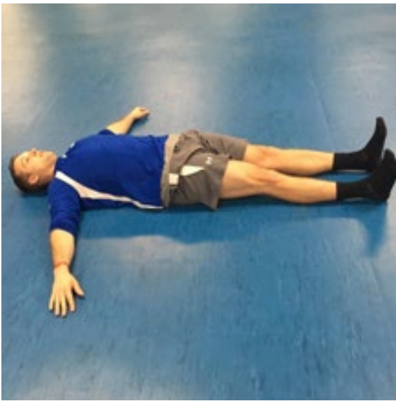
FIGURE 9. ACTIVE STRAIGHT-LEG RAISE TEST

The active straight-leg raise test assesses active hamstring flexibility while maintaining a stable pelvis. The test begins with the athlete lying supine on the floor with their toes pointed up. Slowly and under control, the athlete will lift one leg up as high as possible with the active leg straight, while the opposite leg and low back remain flat on the floor. If the athlete's active leg does not stay straight or if it cannot reach a point where it is perpendicular to the floor, then there could be hamstring or plantar flexor tightness. If the opposite limb lifts off the floor, or the pelvis moves into an anterior tilt, then the hip flexors on that limb are most likely tight (4).