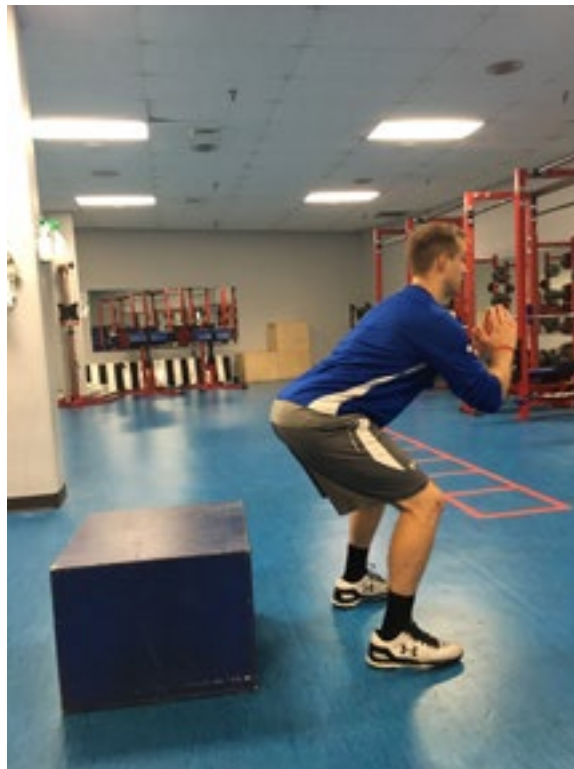
FIGURE 7. DROP LANDING TEST