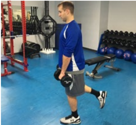
FIGURE 19. DUMBBELL SINGLE-LEG ROMANIAN DEADLIFT

The athlete begins by standing on one leg with the opposite knee slightly bent and in the air behind the body. Slowly and under control, the athlete flexes the hips keeping the hips square and the dumbbells close to the thighs. The athlete pauses at the bottom position with their back flat and parallel to the floor with the opposite leg flat and parallel to the floor as well. The athlete returns to the starting position while maintaining a rigid torso. This exercise is great for athletes with weak hamstrings, spinal erectors, and gluteus maximus muscles. This exercise can be used in the preparation and endurance phases of the off-season or in the in-season.