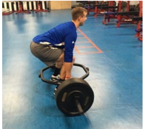
FIGURE 21. TRAP BAR DEADLIFT

This exercise begins with the athlete standing with their feet shoulder-width apart inside the trap bar. To get into the starting position, the athlete pushes their arms and hips back like they are going to perform a vertical jump, grabbing the bar at the bottom of the motion. From there, the athlete pushes the shoulder blades together and puts the spine in a neutral position. When looking at the start position from a lateral viewpoint, the shins should be near vertical, the hips should be higher than the knees, the torso should be rigid, and the spine should be neutral. Slowly and under control, the athlete drives through the heels with the hips and torso rising at the same time. The athlete finishes by extending the hips and knees fully to come to an erect, or standing, position. The athlete then lowers the bar under control to the floor. This exercise is great for developing the hamstrings, glutes, and erectors while placing minimal stress on the knee joints. The trap bar deadlift can be used in all phases of the off-season and in-season.