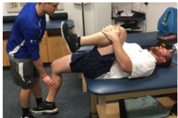
FIGURE 5. THOMAS TEST