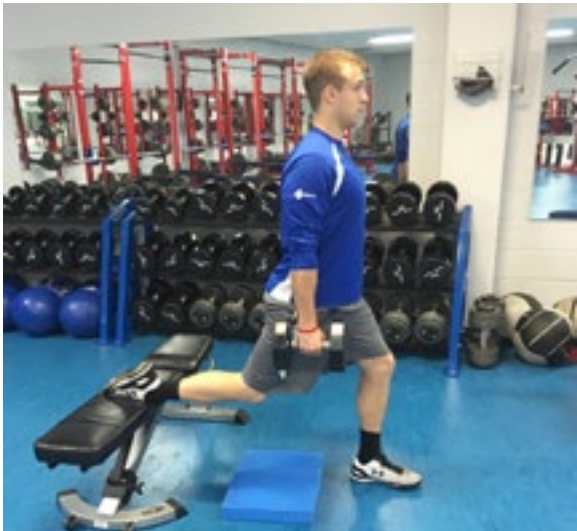
FIGURE 23. DUMBBELL BULGARIAN SPLIT SQUAT

The exercise begins with the athlete's rear foot on top of a bench behind their body. The athlete then takes a step out with the lead foot away from the bench. With the weight on the front heel, the athlete lowers their body under control until the front thigh is parallel to the floor. The athlete then drives through the front heel and returns to the starting position. This exercise can be loaded in a variety of ways, not just dumbbells, and can be used in all phases of the off-season and in-season.