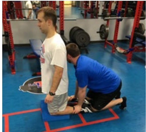
FIGURE 25. BUDDY HAMSTRINGS

This exercise begins with one athlete kneeling on a pad and a partner holding his ankles. With the torso and hips in a neutral and erect position, the athlete slowly falls to the floor maintaining the rigid posture with their hands out ready to absorb the impact of falling. When the athlete's hands touch the floor, they immediately push back to the starting position with as little upper body force as possible, relying on the hamstrings to pull the torso back up. It is important that the rigid posture is maintained throughout the exercise to avoid injury and emphasize the hamstrings. This exercise is great for developing eccentric hamstring strength and can be used in all phases of the off-season and in-season.