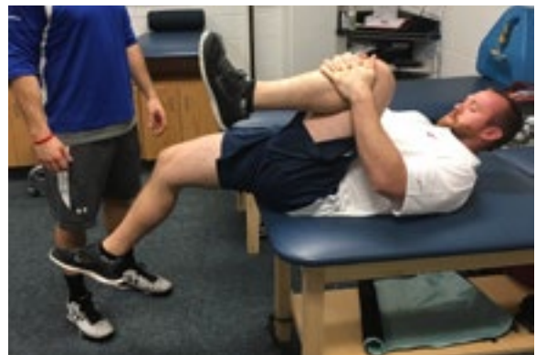
FIGURE 4. THOMAS TEST