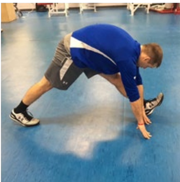
FIGURE 16. TWO-PART LUNGE