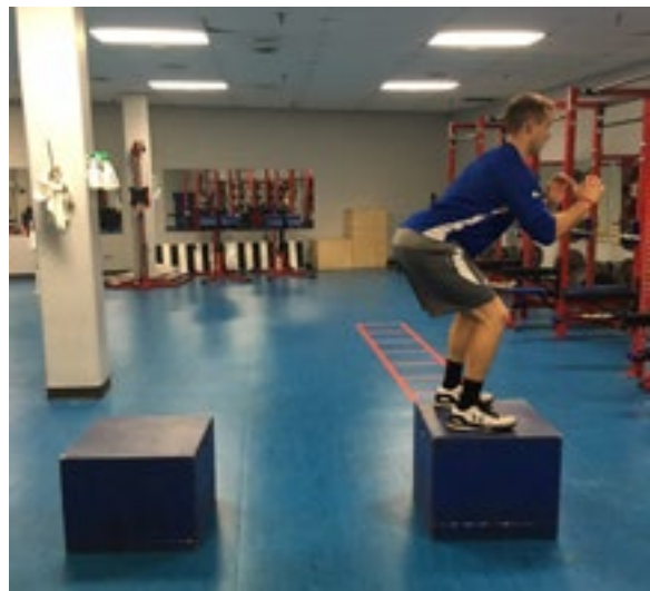
FIGURE 29. DEPTH JUMP TO BOX