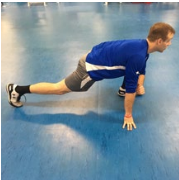
FIGURE 15. TWO-PART LUNGE

The athlete begins by stepping into a forward lunge and attempting to reach the ipsilateral elbow to the floor while keeping the back leg as straight as possible. After holding for one second, the athlete places both hands on the ground and straightens the front leg out. After holding for one second, the athlete steps forward with the opposite leg and repeats the same movement for the desired number of repetitions.