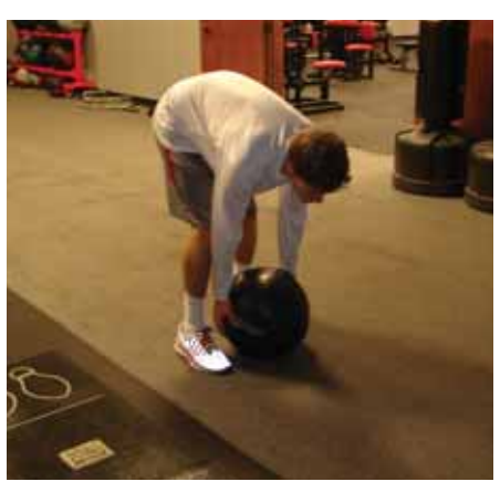
FIGURE 2. MODIFIED HORIZONTAL SCOOP TOSS - BLOCK START