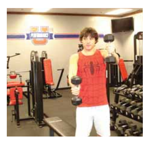
FIGURE 10. ALTERNATING DUMBBELL FRONT RAISE