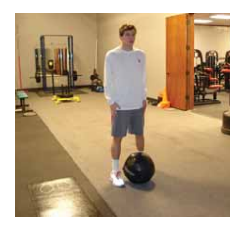
FIGURE 1. MODIFIED HORIZONTAL SCOOP TOSS - START

Start with the medicine ball placed between the feet. In one quick explosive movement, grasp the medicine ball with both hands on either side of the ball. Swing the arms forward and explosively jump while releasing the ball horizontally against the wall.