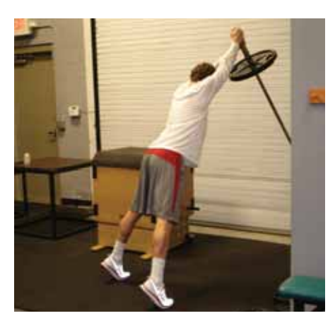
FIGURE 6. ANCHORED BARBELL SQUAT PRESS - TRIPLE EXTENSION