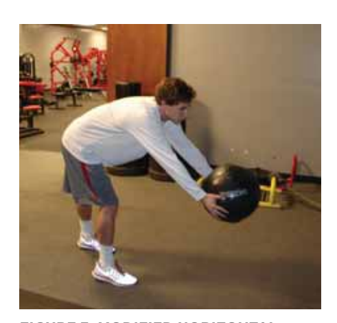
FIGURE 3. MODIFIED HORIZONTAL SCOOP TOSS - RELEASE