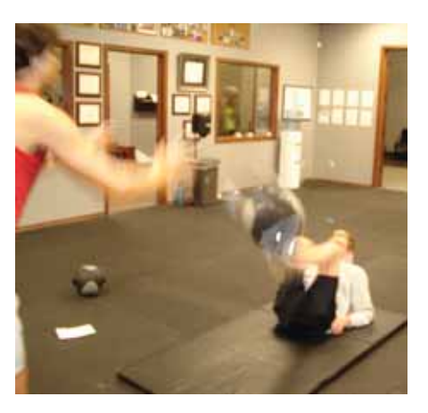
FIGURE 8. DONKEY KICK - FOOT CONTACT WITH EXTENSION