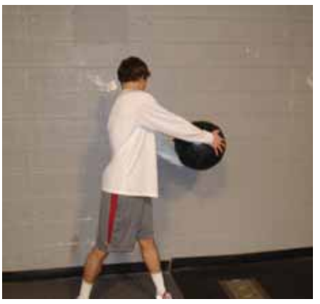
FIGURE 16. STANDING ROTATIONAL WALL TOSS - LEFT