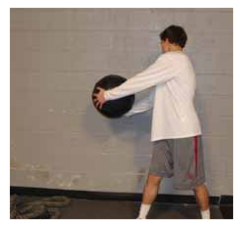
FIGURE 15. STANDING ROTATIONAL WALL TOSS - RIGHT