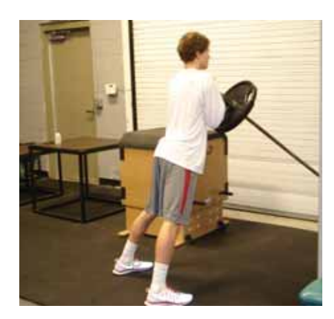
FIGURE 4. ANCHORED BARBELL SQUAT PRESS - START

Start in an upright position holding the end of the bar with both hands at chest level. Flex at the hips and knees to perform a squat, then drive through the heels, extend the hips, and drive the bar above the head.