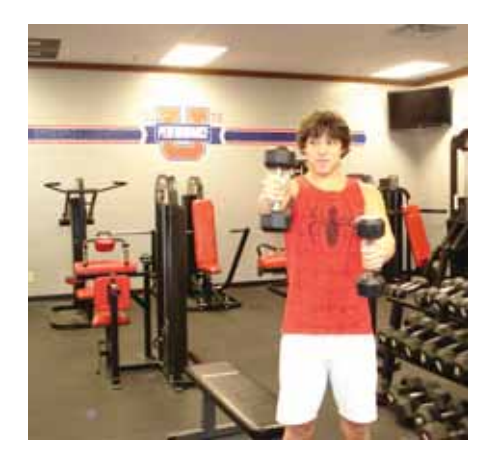
FIGURE 9. ALTERNATING DUMBBELL FRONT RAISE

Start with dumbbells in front of the body with elbows slightly bent. Staying under control, move the arms quickly up and down, while performing flexion and extension at the shoulder.